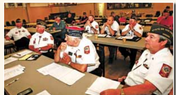
New Commanders as well as Seasoned Commanders listen and learn in the Commander class held at the Eugene SOI.